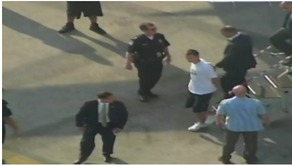
Video: 'Barefoot bandit' sets foot in Miami