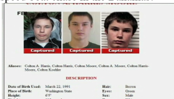
Video: Who is the 'Barefoot Bandit' suspect?

His alleged crime spree spanned several states and ended on Sunday after a high-speed boat chase in the Bahamas.